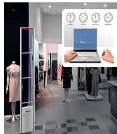
EVOLVE P30 without advertising panel inserts

*Ruby Red optional colored base cover shown above