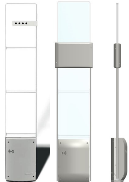
With integrated people counting (optional extra)

The EVOLVE G35 is customisable to fit into any environment, the Plexiglass design and integrated LEDs - which can be set to permanent on or when the antenna is alarmed - is perfect for those retailers who want a great design without sacrificing performance. The optional integrated people counter units enable retailers to discreetly and accurately capture visitor numbers, which can then be automatically uploaded to a reporting service of choice and the RFID upgrade kit offers a cost effective option for retailers who want to benefit from using RFID as EAS. The base plate covers can be co-ordinated to blend into your store environment, making the G35 a truly customisable solution*.