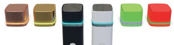
Multiple Trim Colour Options